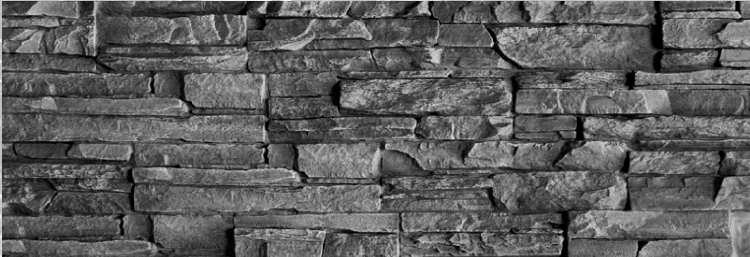
STACKED STONE / SMOKED SLATE