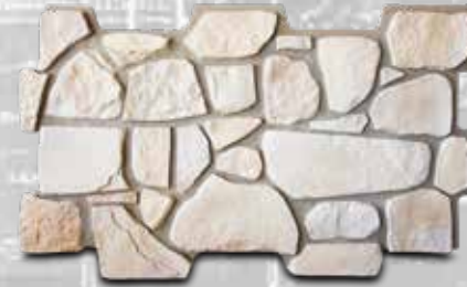
NW FS4830-LS Limestone