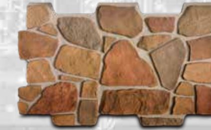
NW FS4830-DR Durango