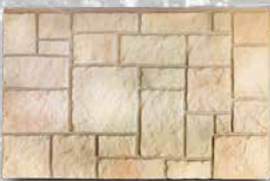
NW CR4830-BG Beige Blend