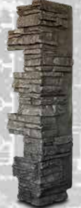
NW SS36COR-SMSL Staggered Stacked Stone Corner Smoked Slate