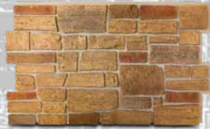
NW LS4830-DR Durango