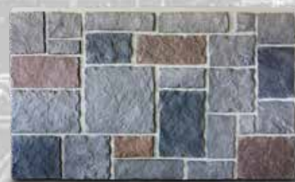
NW CR4830-SG Shadow Grey