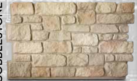
NW CS4830-BG Beige Blend