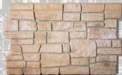
NW LS4830-SS Sierra Sand