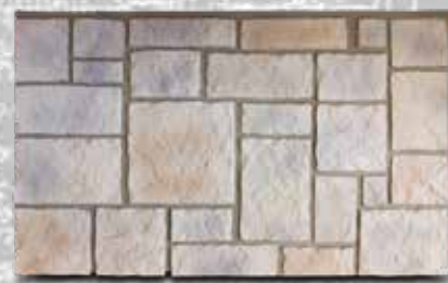
NW CR4830-DB Dakota Blend