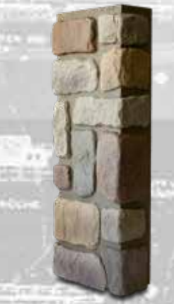
NW CSCLST1230-ST Cobblestone Straight Left Corner Summer Tan