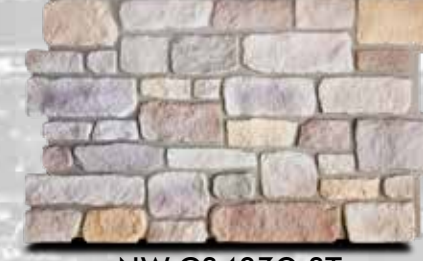
NW CS4830-ST Summer Tan