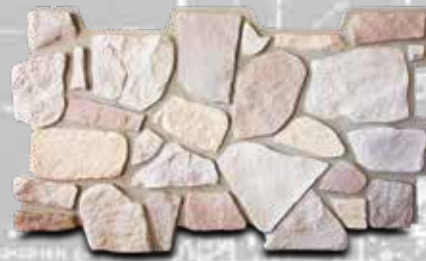
NW FS4830-ST Summer Tan