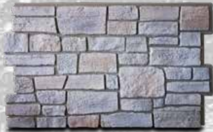
NW LS4830-DB Dakota Blend