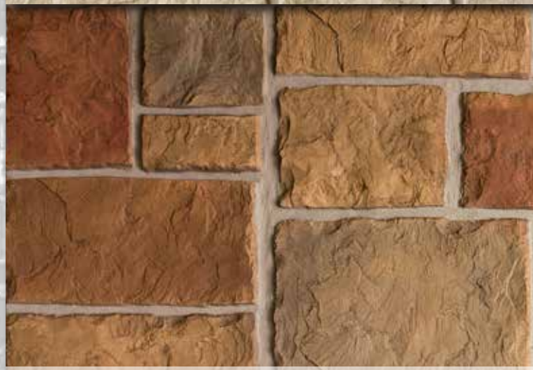
CASTLE ROCK / DURANGO