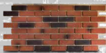
NW BR5222-BX Bordeaux Classic Brick panels are 52" X 22" and cover approx 7.9 sq. ft.