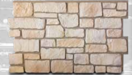
NW CS4830-LS Limestone