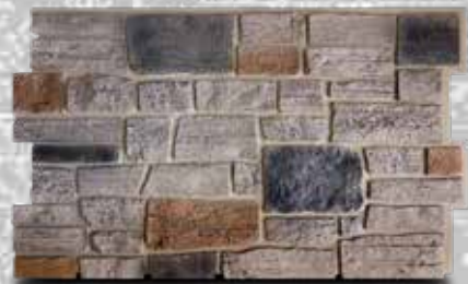
NW LS4830-SG Shadow Grey