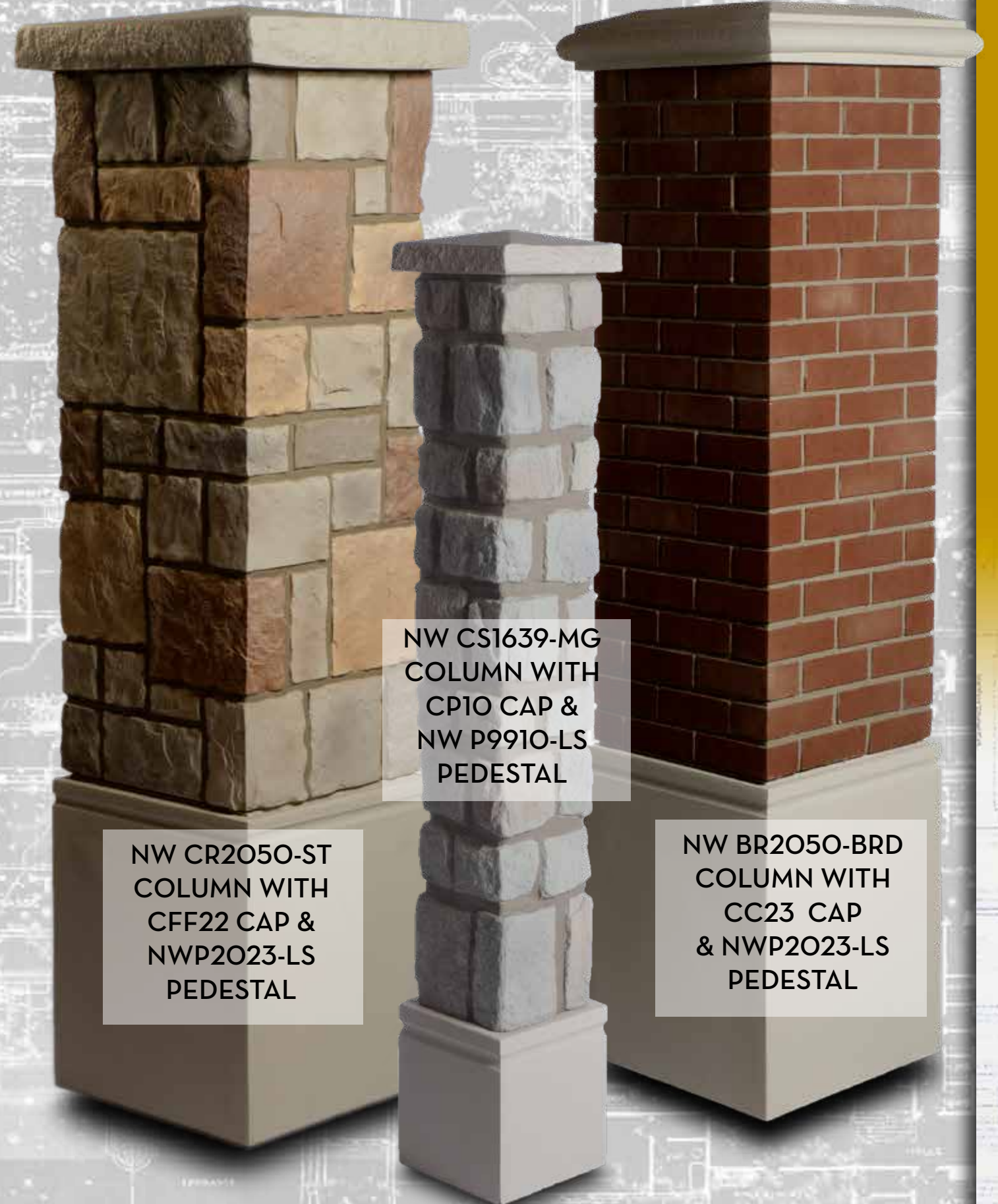
NW CS1639-MG COLUMN WITH CP10 CAP & NW P9910-LS PEDESTAL