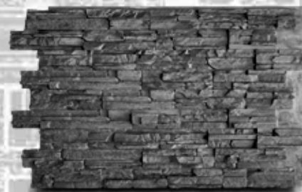
NW SS4836-SMSL Smoked Slate