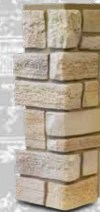
NW LSCSG1030-LS Ledgestone Staggered Corner Limestone