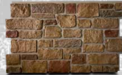
NW CS4830-DR Durango