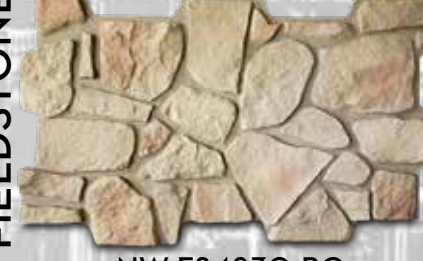
NW FS4830-BG Beige Blend