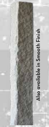
NW OC4448-LS Universal Outside Corner Limestone