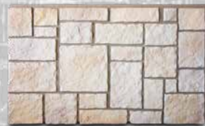
NW CR4830-LS Limestone