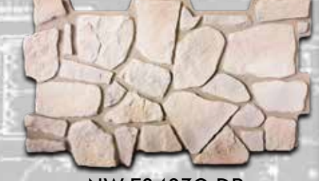
NW FS4830-DB Dakota Blend