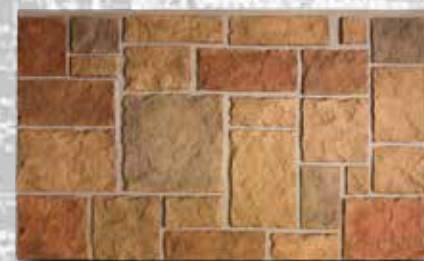
NW CR4830-DR Durango