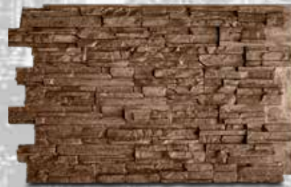
NW SS4836-MJB Mojave Brown