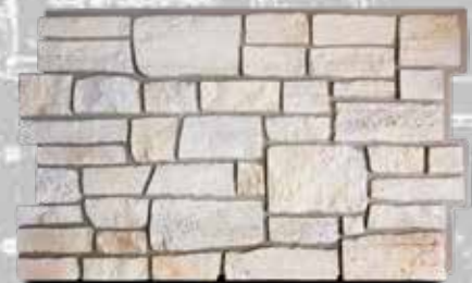
NW LS4830-LS Limestone