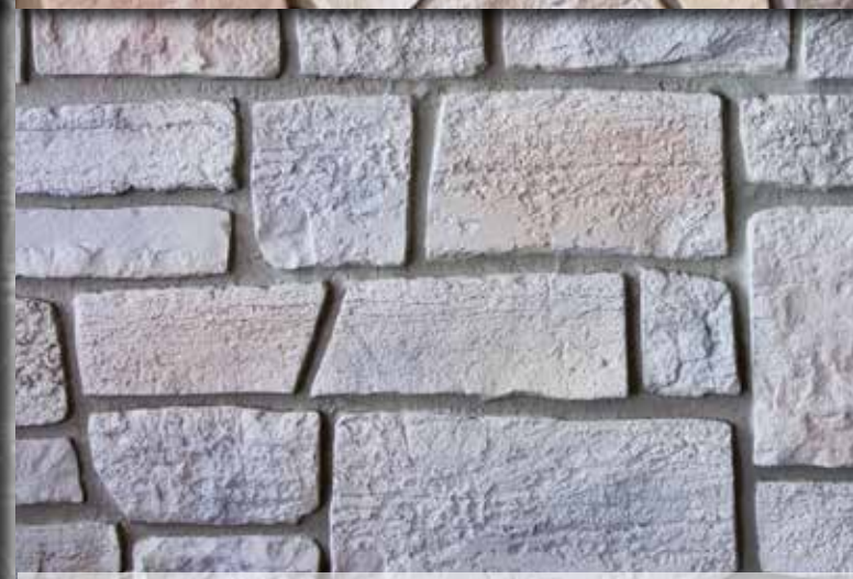
LEDGESTONE / SUMMER TAN