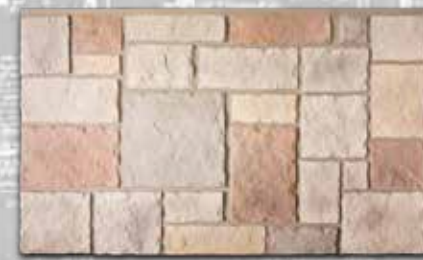
NW CR4830-ST Summer Tan