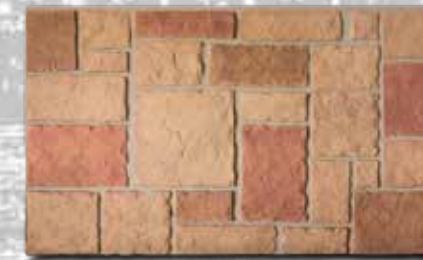
NW CR4830-SN Sonora