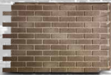
NW BRK5334-RB Rich Brown Traditional Brick panels are 53" X 34" and cover approx 12.5 sq. ft.