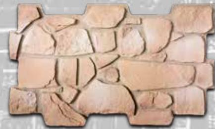
NW FS4830-SS Sierra Sand