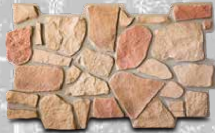
NW FS4830-SN Sonora