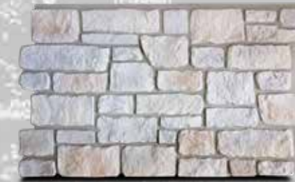
NW CS4830-DB Dakota Blend