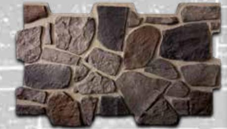
NW FS4830-SG Shadow Grey