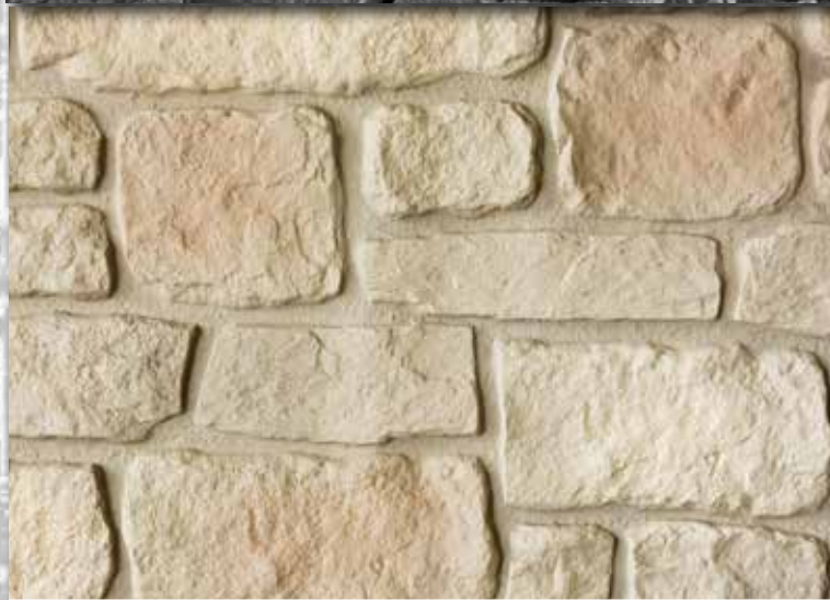
COBBLESTONE / BEIGE BLEND