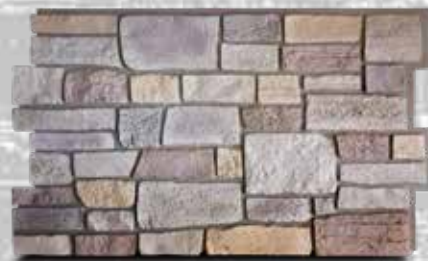
NW LS4830-ST Summer Tan

Although we have taken the utmost care in making sure that these images accurately represent the colors of our masonry panels, printing cannot render an exact replication of every color and tone. Nu-Wood recommends viewing samples to confirm a match for your project.