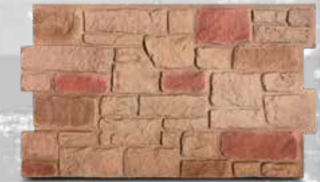
NW CS4830-SN Sonora