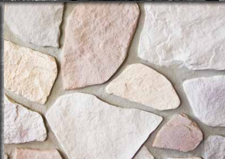
FIELDSTONE / SUMMER TAN