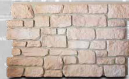
NW CS4830-SS Sierra Sand