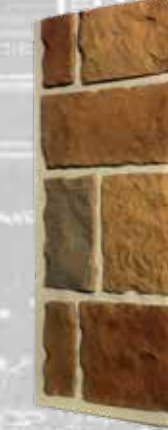
NW CRCL1230-DR Castle Rock Straight Left Corner Durango