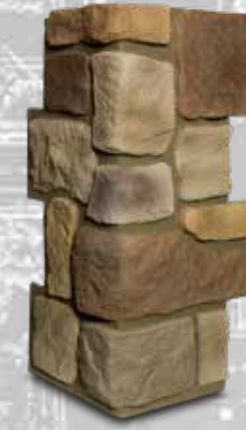
NW CSCSG1030-DR Staggered Cobblestone Corner Durango