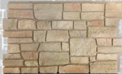
NW LS4830-BG Beige Blend