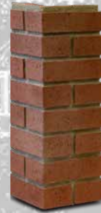
NW BRC8822-BRD Straight Brick Corner Classic Brick Bold Rouge Dusted