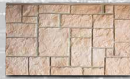
NW CR4830-SS Sierra Sand