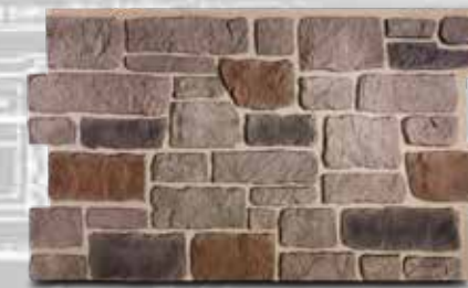
NW CS4830-SG Shadow Grey