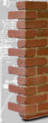
NW BRK-CORWB-BRD Staggered Brick Corner Weathered Brick Bold Rouge Dusted