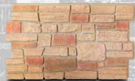
NW LS4830-SN Sonora