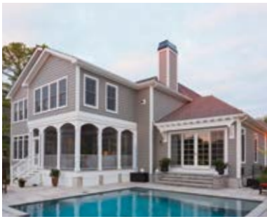
CELECT® CELLULAR COMPOSITE SIDING