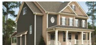
ROYAL® SHUTTERS, MOUNTS & VENTS