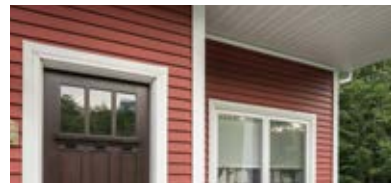
ROYAL® VINYL SIDING