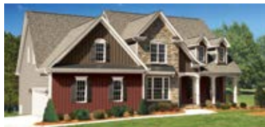
HAVEN® INSULATED SIDING