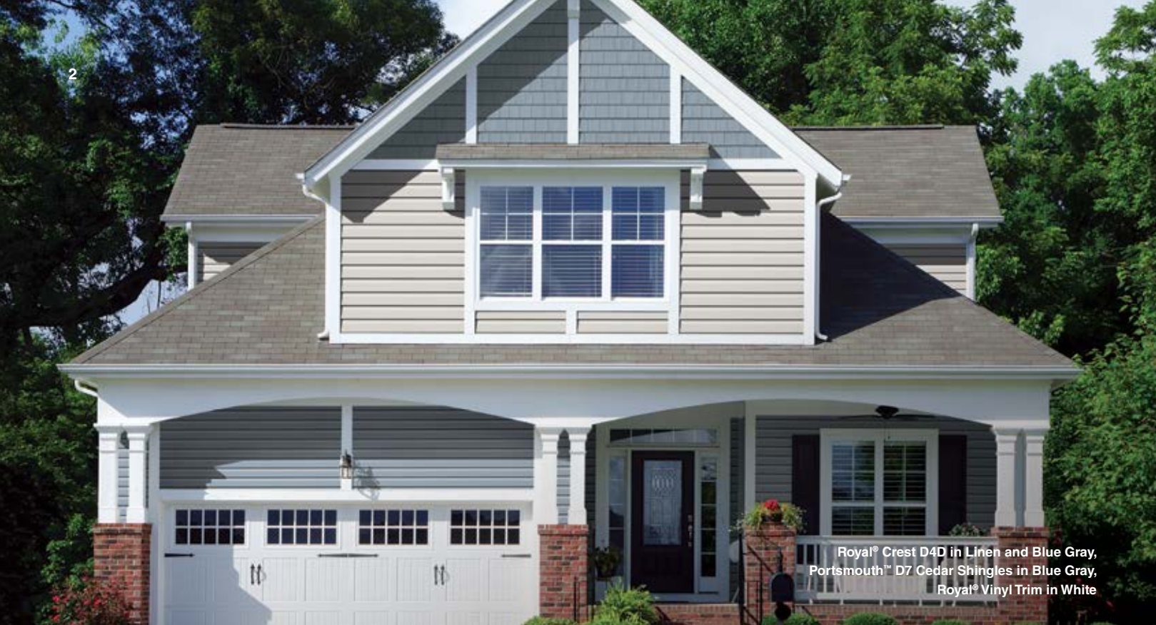
Royal® Crest D4D in Linen and Blue Gray, Portsmouth™ D7 Cedar Shingles in Blue Gray, Royal® Vinyl Trim in White