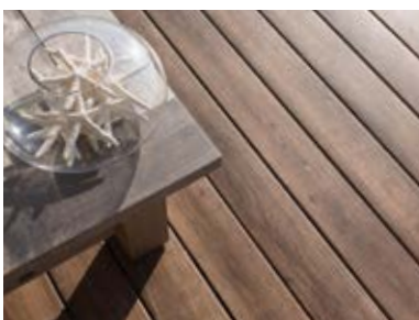
ZURI® PREMIUM DECKING