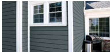
ROYAL® TRIM & MOULDINGS