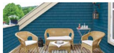
PORTSMOUTH™ SHAKE & SHINGLES