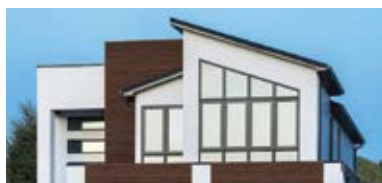
CEDAR RENDITIONS™ ALUMINUM SIDING