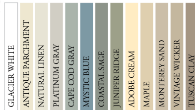
STANDARD COLOR COLLECTION†