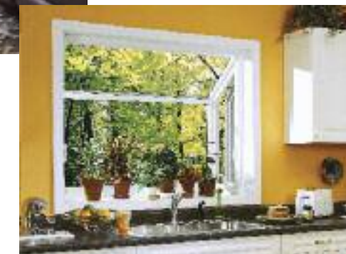
Garden Windows are an ideal way to open up the visual space in any room.