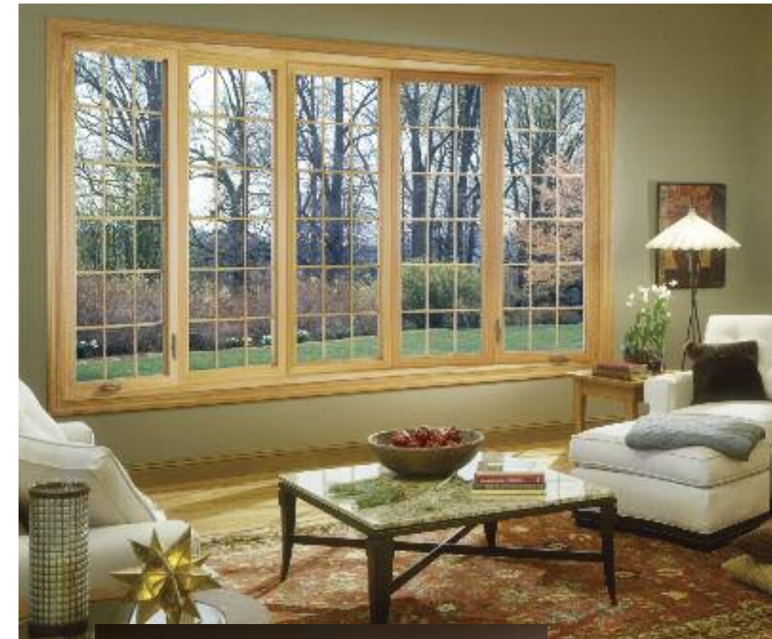
Bow and Bay Windows are a beautiful way to add architectural interest to your home – both inside and out.