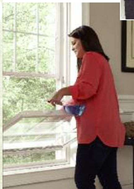
Tilt-in sashes make cleaning easy! Simply tilt-in, wipe with a clean cloth and snap back into place.