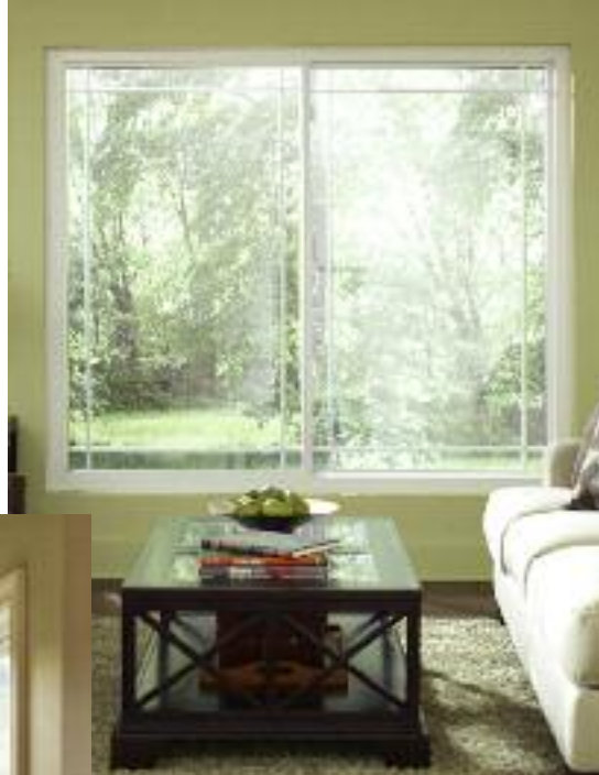
The sleek design of this 2-Lite Sliding Window showcases the beauty of the outdoors.