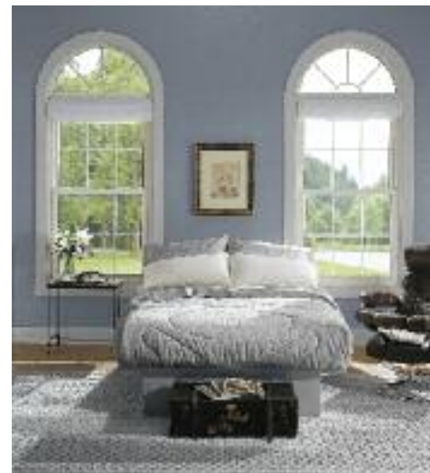
The simple, understated beauty of double-hung windows adds style and elegance to any home.