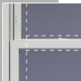
Maximized Glass Area