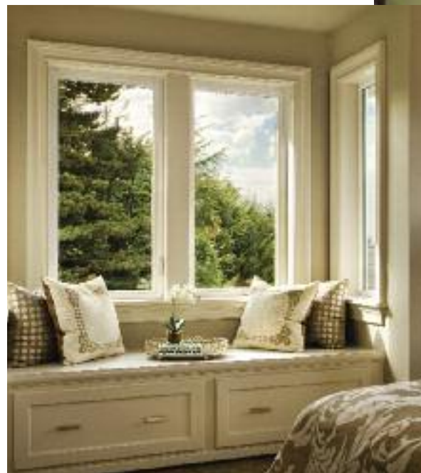
Casement Windows feature a single lever release with a three-point multi-lock system.