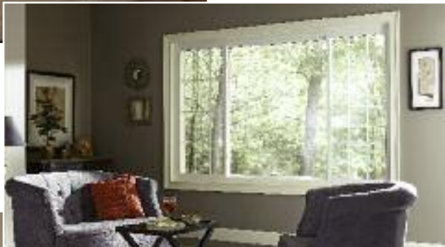
Our 3-Lite Sliding Window makes sitting areas brighter.