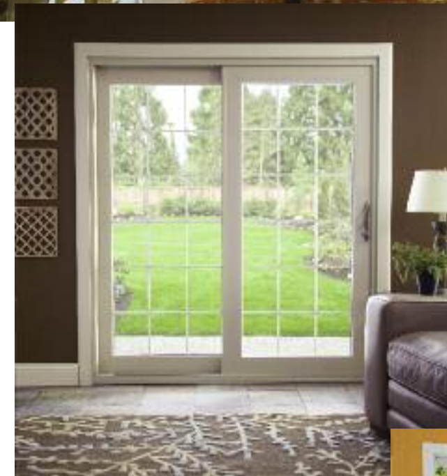
Sliding Patio Doors extend a room to the outside, adding instant spaciousness and light to your home.