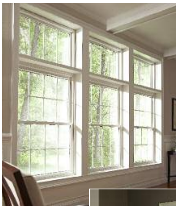
The slimline design of this Double-Hung Window complements any décor.

Manufactured exclusively for The Acri Company