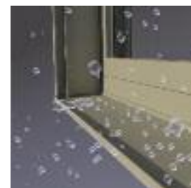
True Sloped Sill