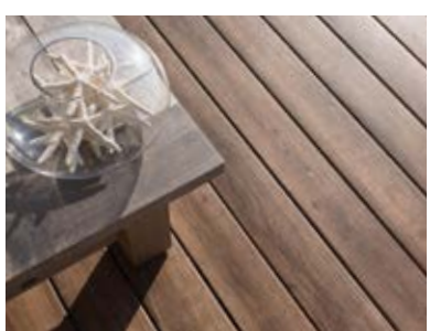
ZURI® PREMIUM DECKING