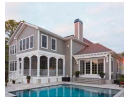
CELECT<sup>®</sup> CELLULAR COMPOSITE SIDING