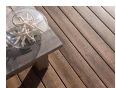
ZURI® PREMIUM DECKING